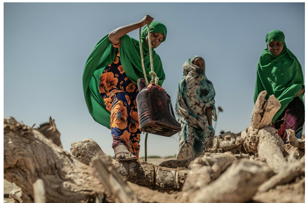
Women and girls often walk long distances to fetch water during droughts. Somali girls collect water from a well in Docoloha village, Somaliland.

Deep existing inequalities mean that small-scale producers, who produce more than 70% of the food consumed for people living in Asia and sub-Saharan Africa<sup>65</sup>, and the more than 1.7 billion people working on farms, plantations, fishing boats and in processing factories<sup>66</sup>, are often unable to produce enough food, or earn enough income, to escape hunger and poverty.