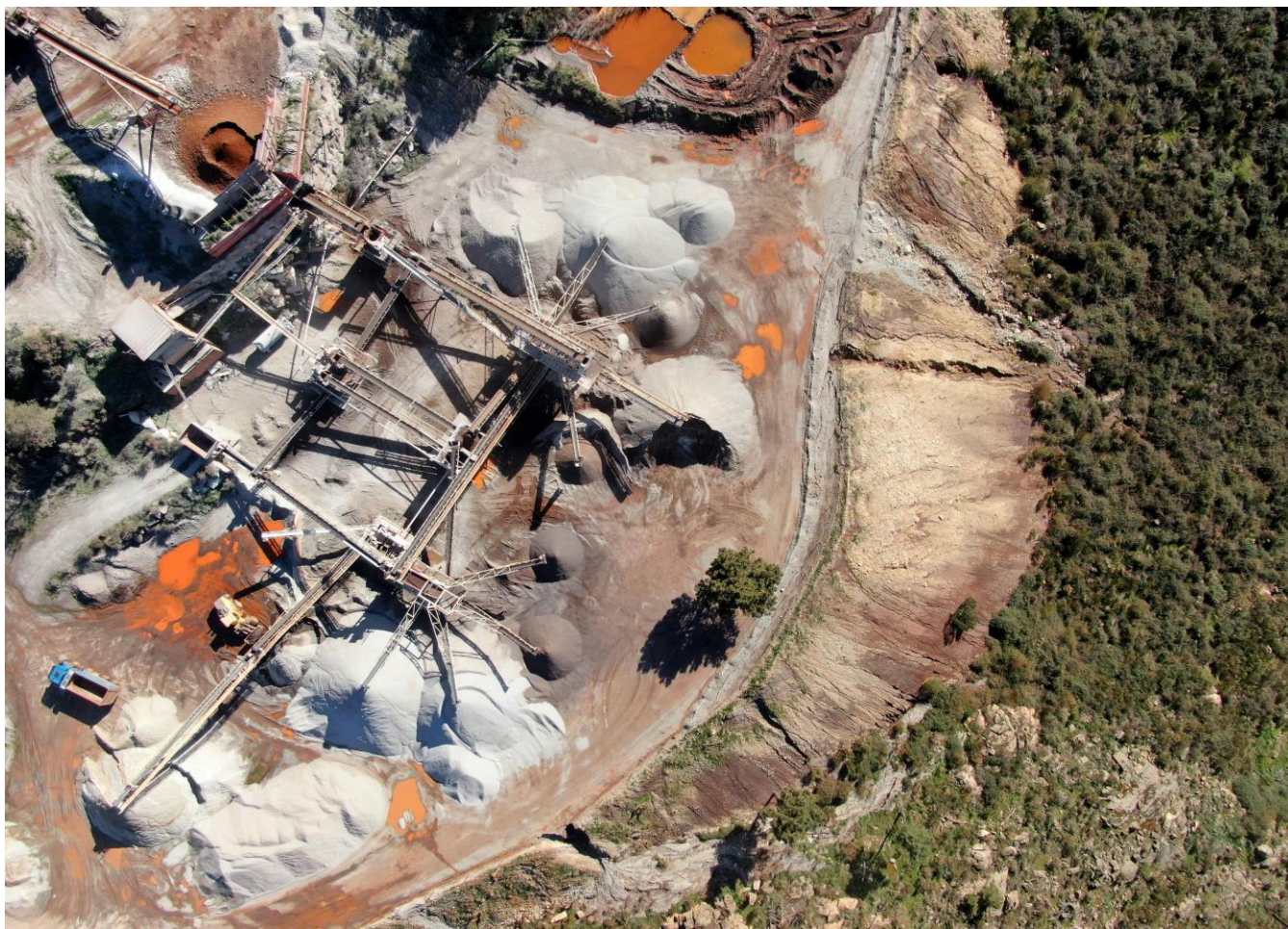
Aerial image of crushing and washing of gravel iron ore at a quarry in Felgar, Municipality of Torre de Moncorvo, Portugal