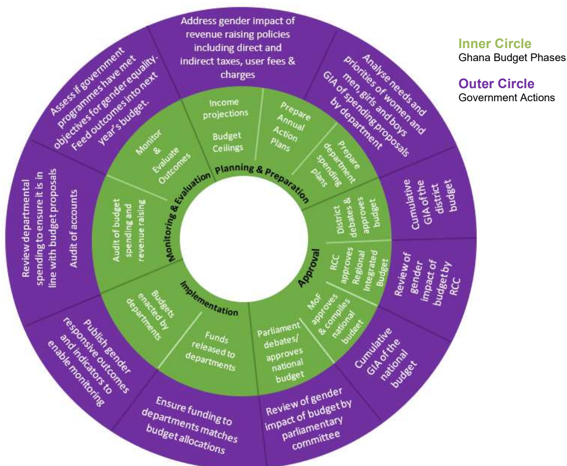
Figure 2. Ghana's budget process phases and potential GRB actions

Note: GIA = gender impact assessment.